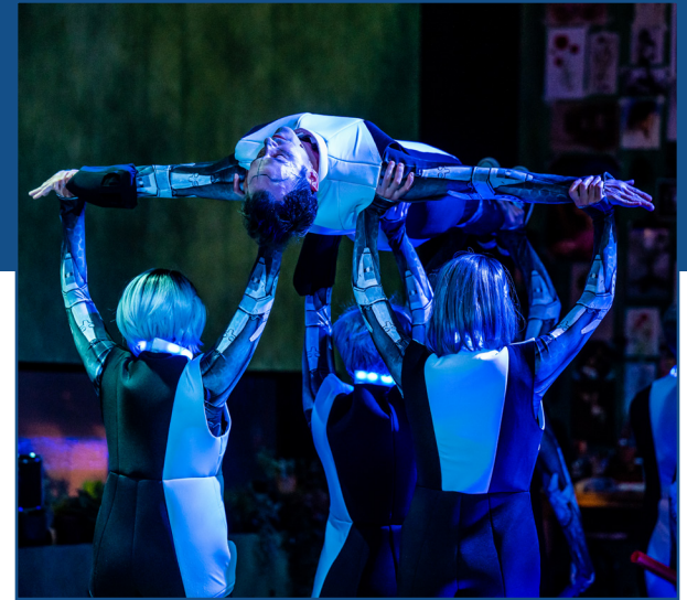
R.U.R. A Torrent of Light, 2022.

Artistic partners include National Arts Centre, Vancouver Opera, Obsidian Theatre, Victoria Symphony, Sistema Toronto, Canadian Stage, Soulpepper, Toronto Symphony Orchestra, Shaw Festival, National Youth Orchestra, Tarragon Theatre, Native Earth Theatre, Edinburgh Fringe Festival, and other local, national, and international organizations.